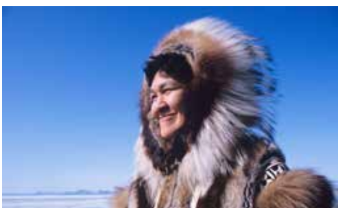
Special clothing to keep warm

Giant lumps of ice that float in the cold sea around Antarctica are called icebergs.