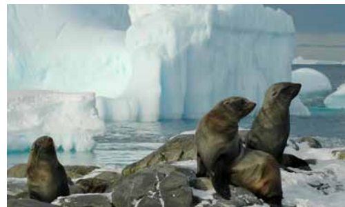
Fur seals on the ice

Antarctica is the coldest place on Earth.