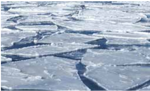
The Arctic Ocean is covered in ice

Arctic countries include the USA (Alaska), Canada, Norway and Russia.